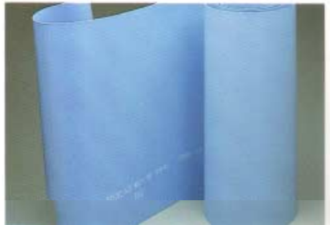
Blue, static control, 10 11 to 2 x 10 10 , 10 11 to 3 x 10 10 or 10 11 to 4 x 10 10 Layer Static Dissipative

18" x 2' to 100' x 3' or 100' x 4' to 100'